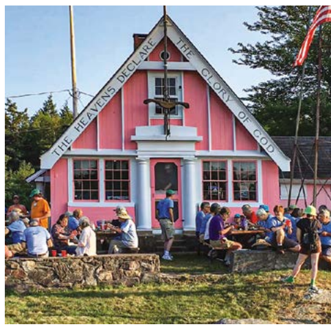
Stellafane, the clubhouse of the Springfield Telescope Makers.