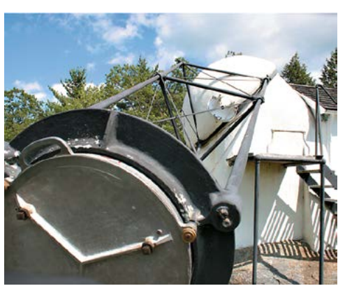
The primary cell (foreground), boom, and turret of the Porter Turret Telescope.

The Porter Turret Telescope was constructed in 1930 by the club. Porter, who had endured more than his share of winter cold on polar expeditions early in his career, developed a design that allowed the observer to remain indoors and comfortable on the coldest winter nights. Extensively renovated including new optics in the 1970s, the Porter Turret remains an excellent instrument, and is operated during Convention during the day for solar observation, as well as at night.