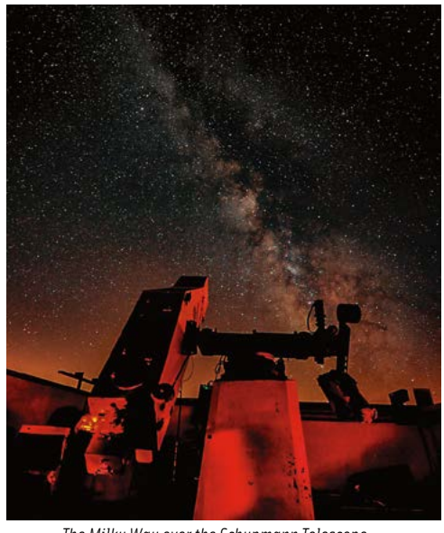
The Milky Way over the Schupmann Telescope.

The McGregor Observatory at Stellafane East was constructed by the club between 1989 and 1995. It houses a unique instrument—a 13" f/10 Schupmann telescope mounted on a massive computer controlled alt-az mounting. For a time it was the largest operating Schupmann in the world. This design, which combines reflective and refractive elements, yields a coma-free and essentially apochromatic image, and is ideal for planetary observation. The Schupmann is operated during Convention.