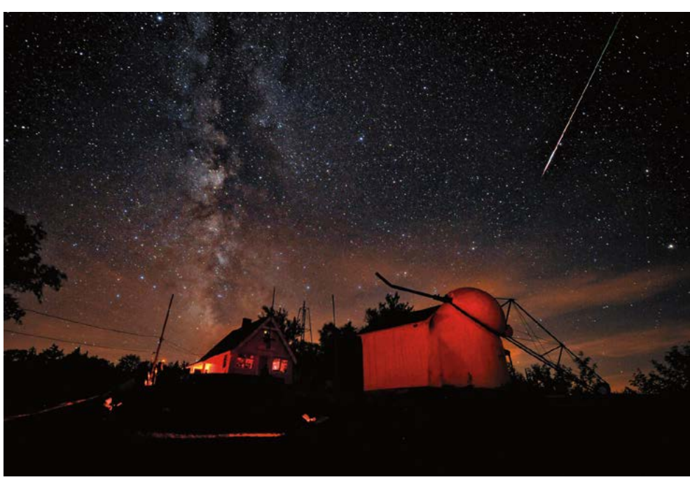
Perseid meteor over Stellafane clubhouse and Porter Turret Telescope.

Although many stay in motels and inns in the Springfield area, camping out has been traditional at The Stellafane Convention from the very beginning.