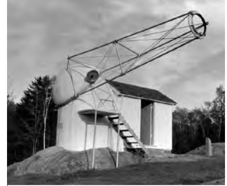
The Porter Turret Telescope in the 1930s.