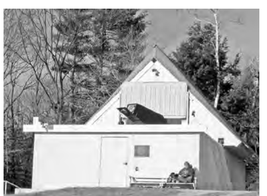
The McGregor Observatory with its roof retracted and the Schupmann telescope visible.

In the late 1980s and the first half of the 1990s, the Springfield Telescope Makers undertook a huge project—the construction of a new roll-off-roof observatory and a 13" Schupmann telescope on a high point at the Northern end of Stellafane East. The telescope is truly a world-class