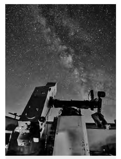
The Schupmann telescope and the Milky Way

instrument, for a time the largest operating Schupmann in the world. It combines reflective and refractive elements to produce an unobstructed coma-free and color-free image, traits that make it an ideal planetary instrument. It is mounted on a massive computer-controlled alt-az mounting.