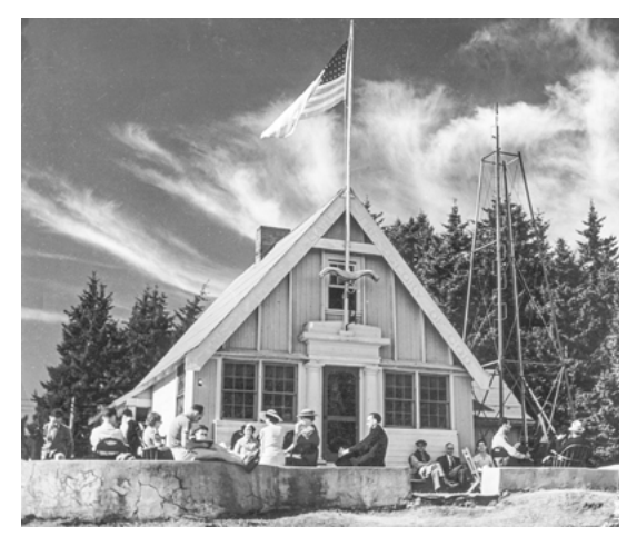
The Stellafane clubhouse as it appeared about 1930. It hasn't changed much since.