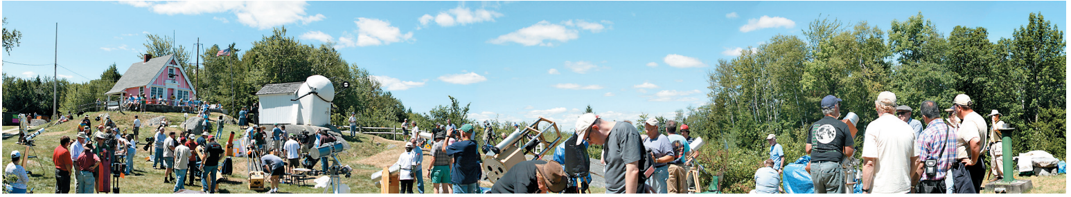
Amateur telescope makers set up in preparation for competition judging. The Stellafane clubhouse and Porter Turret Telescope are in the background.

E very year in the dark of a mid-summer new moon, amateur astronomers and telescope makers travel great distances to gather on a beautiful rural hilltop in Springfield, Vermont. This is The Stellafane Convention, the oldest and one of the largest assemblies of night sky enthusiasts. It has been hosted here at the birthplace of American amateur telescope making by the Springfield Telescope Makers (STM) since 1926.