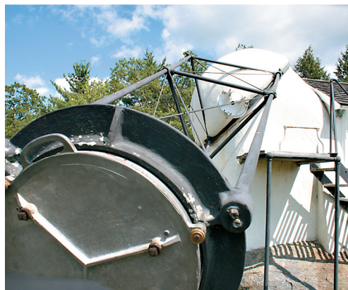
The primary cell (foreground), boom, and turret of the Porter Turret Telescope.

The Porter Turret Telescope was constructed in 1930 by the club. Porter, who had endured more than his share of winter cold on polar expeditions early in his career, invented a design that allowed the observer to remain indoors and comfortable on the coldest winter nights. Extensively renovated including new optics in the 1970s, the Porter Turret remains an excellent instrument, and is operated during Convention, night and day (for solar observation).