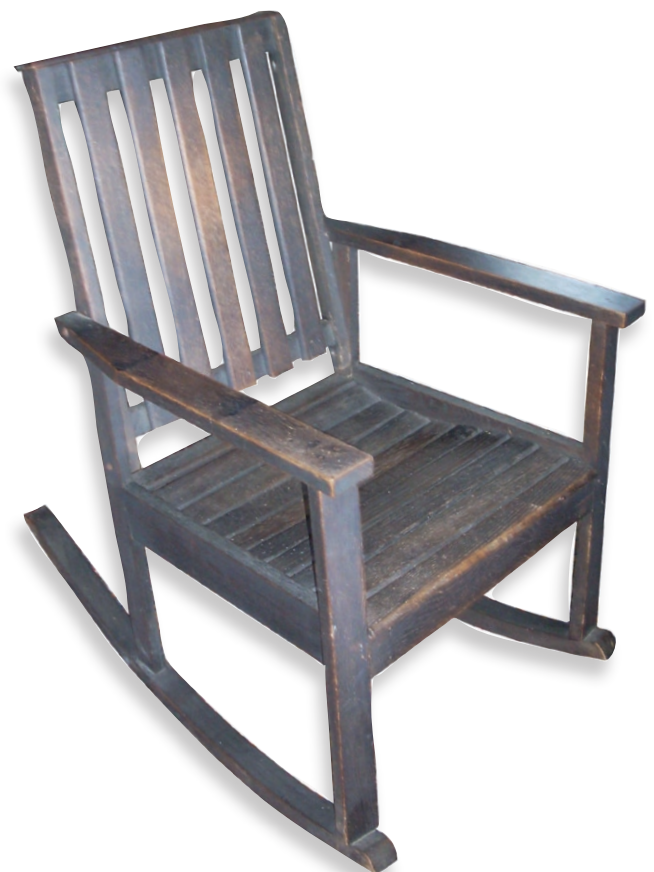
Collection of the Parsons family.