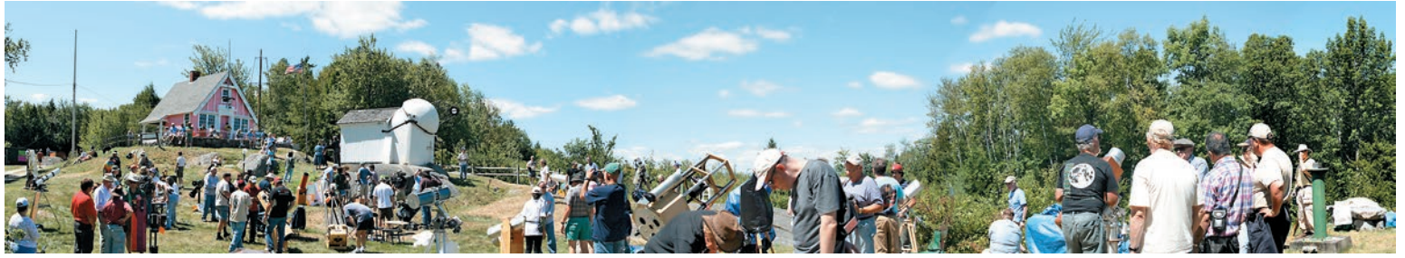
Amateur telescope makers set up in preparation for competition judging. The Stellafane clubhouse and Porter Turret Telescope are in the background.

E very year in the dark of a mid-summer new moon, amateur astronomers and telescope makers travel great distances to gather on a beautiful rural hilltop in Springfield, Vermont. This is The Stellafane Convention, the oldest and one of the largest assemblies of night sky enthusiasts. It has been hosted here at the birthplace of American amateur telescope making by the Springfield Telescope Makers (STM) since 1926.