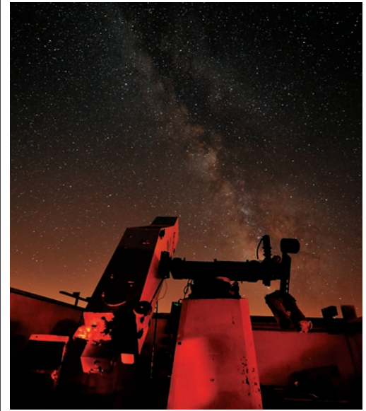
The Milky Way over the Schupmann Telescope.

The McGregor Observatory at Stellafane East was constructed by the club between 1989 and 1995. It houses a unique instrument—a 13" f/10 Schupmann telescope mounted on a massive computer controlled