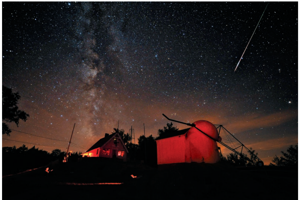
Perseid meteor over Stellafane clubhouse and Porter Turret Telescope.

Although many stay in motels and inns in the Springfield area, camping out has been traditional at The Stellafane Convention from the very beginning. Camping is primitive. Port-a-potties are provided. There is