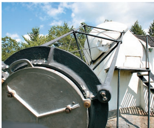
The primary cell (foreground), boom, and turret of the Porter Turret Telescope.

The Porter Turret Telescope was constructed in 1930 by the club. Porter, who had endured more than his share of winter cold on polar expeditions early in his career, invented a design that allowed the observer to remain indoors and comfortable on the coldest winter nights. Extensively renovated including new optics in the 1970s, the Porter Turret remains an excellent instrument, and is operated during Convention, night and day (for solar observation).