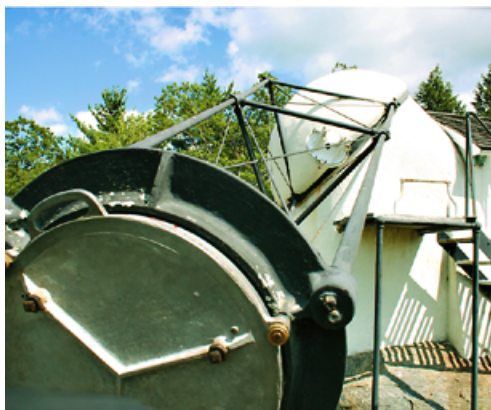
The primary cell (foreground), boom, and turret of the Porter Turret Telescope.

The Porter Turret Telescope was constructed in 1930 by the club. Porter, who had endured more than his share of winter cold on polar expeditions early in his career, invented a design that allowed the observer to remain indoors and comfortable on the coldest winter nights. Extensively renovated including new optics in the 1970s, the Porter Turret remains an excellent instrument, and is operated during Convention, night and day (for solar observation).