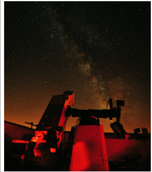
The Milky Way over the Schupmann Telescope.

The McGregor Observatory at Stellafane East was constructed by the club between 1989 and 1995. It houses a unique instrument—a 13" f/10 Schupmann telescope mounted on a massive computer controlled