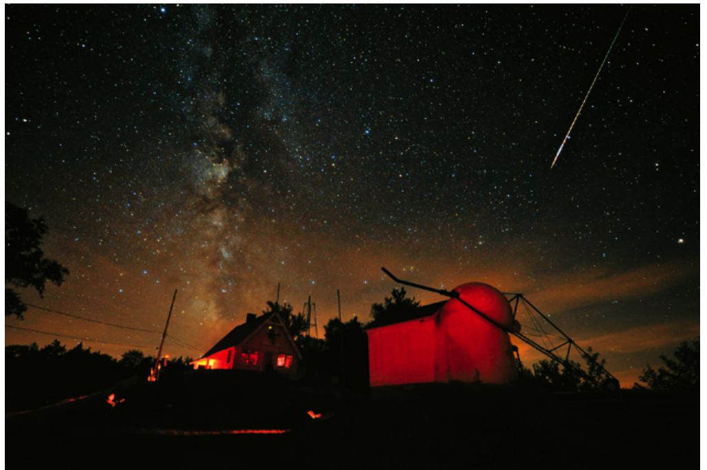
Perseid meteor over Stellafane clubhouse and Porter Turret Telescope.

Although many stay in motels and inns in the Springfield area, camping out has been traditional at The Stellafane Convention from the very beginning. Camping is primitive. Port-a-potties are provided. There is