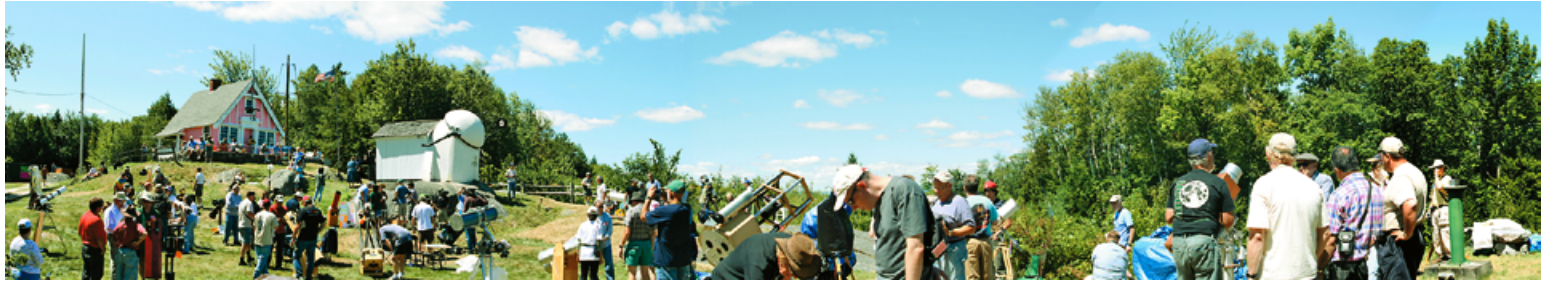
Amateur telescope makers set up in preparation for competition judging. The Stellafane clubhouse and Porter Turret Telescope are in the background.

E very year in the dark of a mid-summer new moon, amateur astronomers and telescope makers travel great distances to gather on a beautiful rural hilltop in Springfield, Vermont. This is The Stellafane Convention, the oldest and one of the largest assemblies of night sky enthusiasts. It has been hosted here at the birthplace of American amateur telescope making by the Springfield Telescope Makers (STM) since 1926.